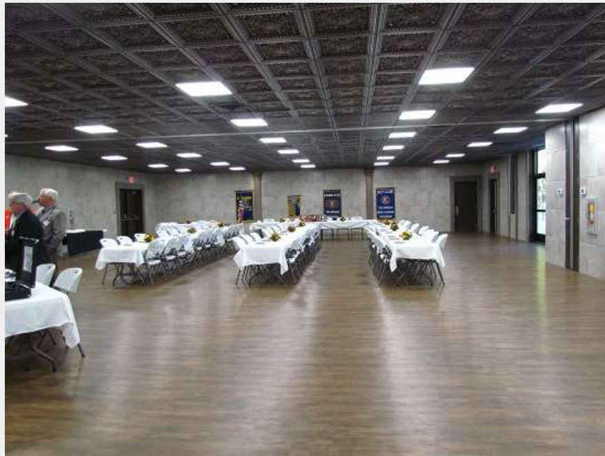
Masonic Temple - renovated hall