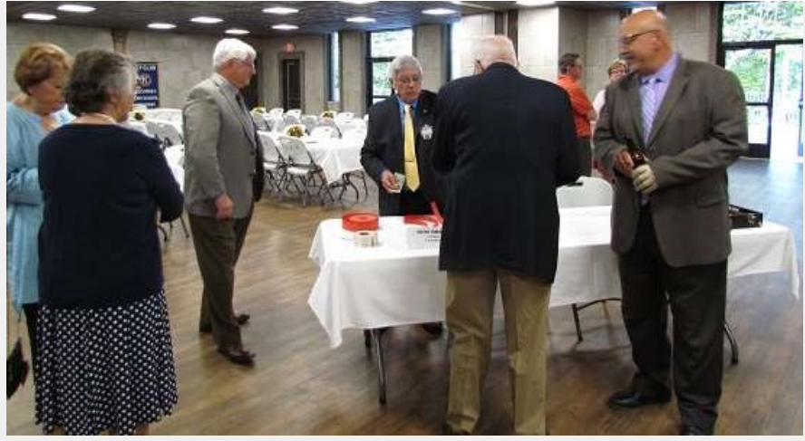
Gathering to pick up badges & purchase 50/50 tickets