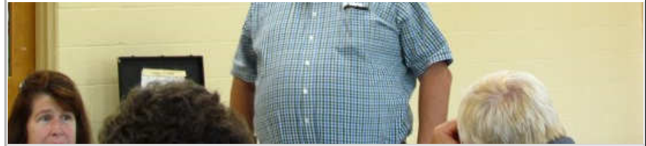
Ron Wimple – circulated a sign-up sheet for notetakers for September