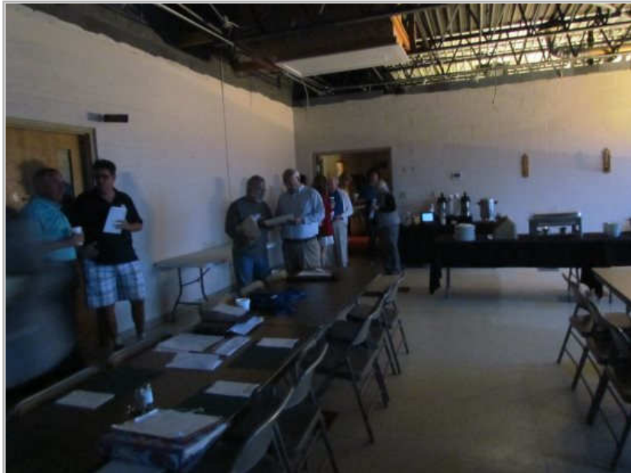
We were greeted this morning with temporary lights and no power for the presentation video.