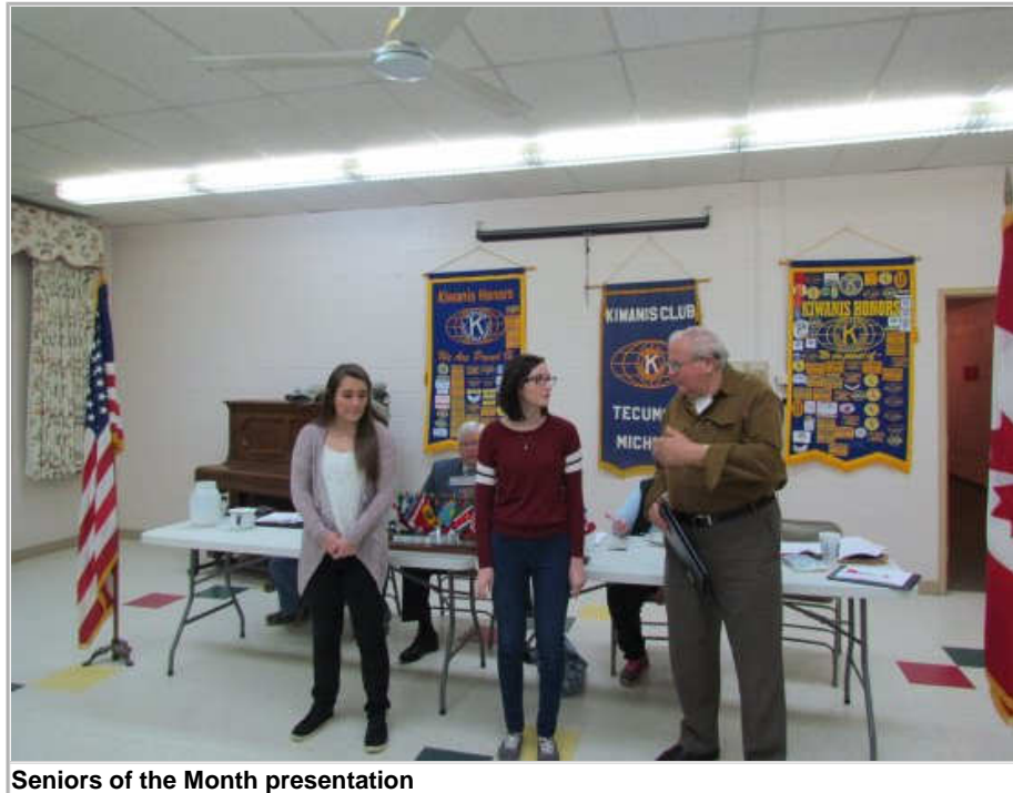
Seniors of the Month presentation

A banquet celebrating our 60th anniversary will be held on Tuesday, May 24 th at 7 PM. By majority vote the event will be at the Lenawee Country Club. Mark your calendars!!! the Governor and Lt. Governor and all Kiwanis clubs in our District will be invited.