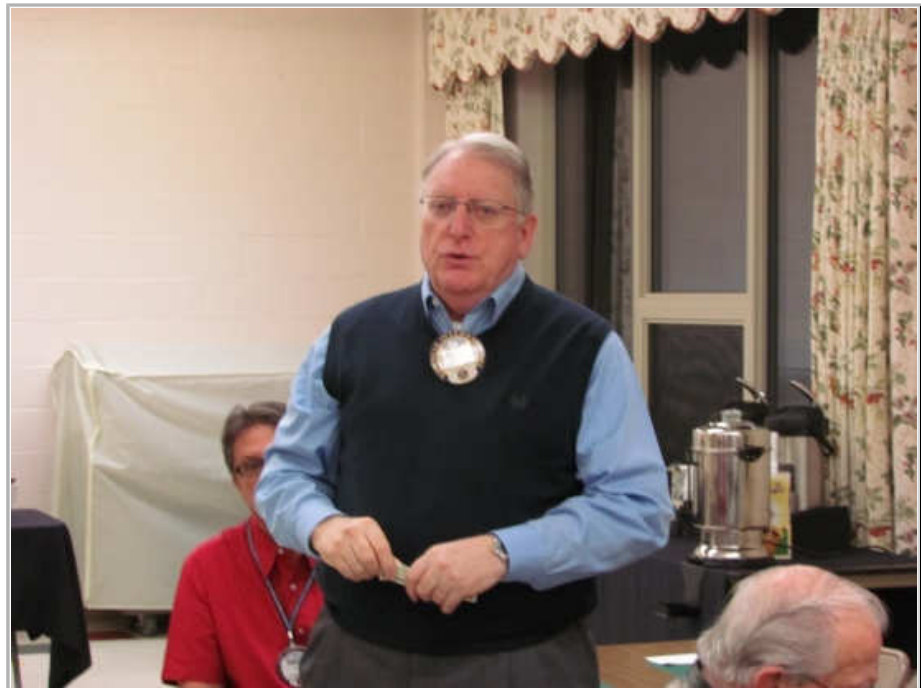
Doug paid a dollar to say that many other businesses such as banks have to follow HIPAA rules.