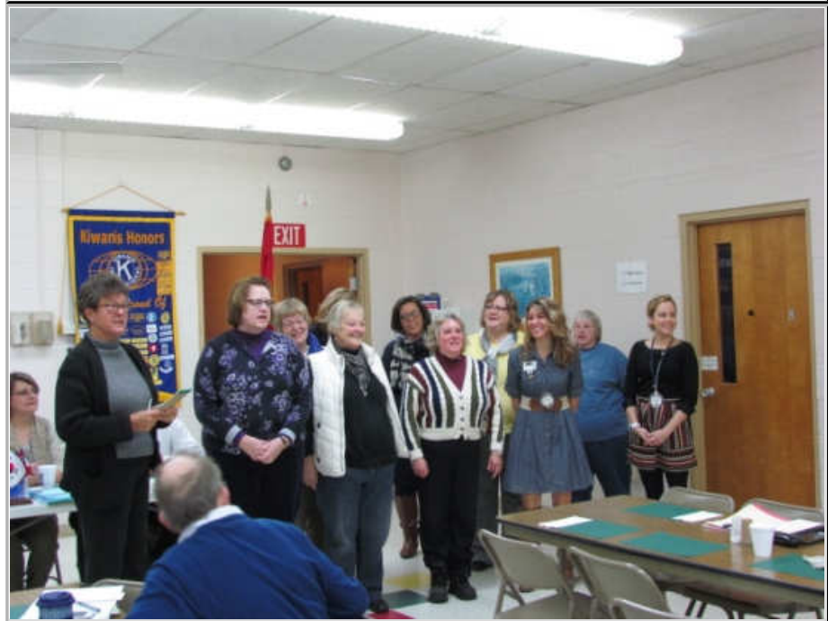
Only the ladies serenaded this morning.