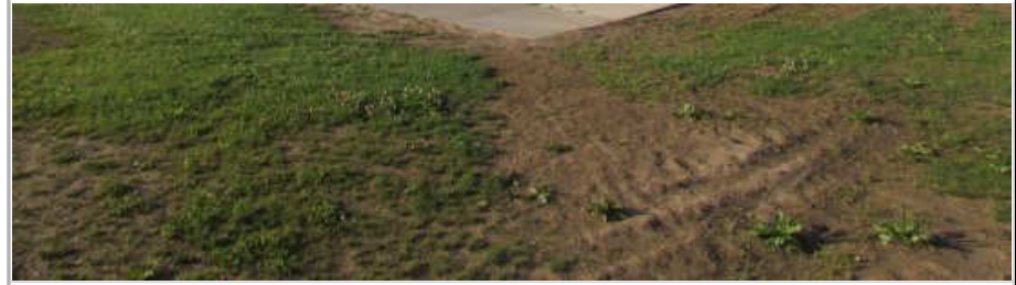
LISD Center for Sustainable Future main class rooms with green roof, attached green house and vegetable garden

Water that drains through the soil on the roof is directed to a 10,000 gallon under ground cistern. A pump that is on a timer pumps water from the cistern to irrigate vegetable plants and other plants on site through drip tubing intalled in the ground