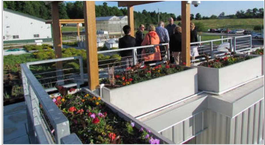
Roof of main building

Roof area showing partly covered with plants. The Plants on the roof are planted in 4 inches of soil and have many varieties of drought tolerant flowers (many varieties of sedums plants) growing on it. The students grow new or different plants in flower pots shown along the railing.