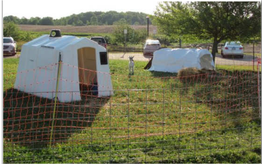
Live stock - goat pictured