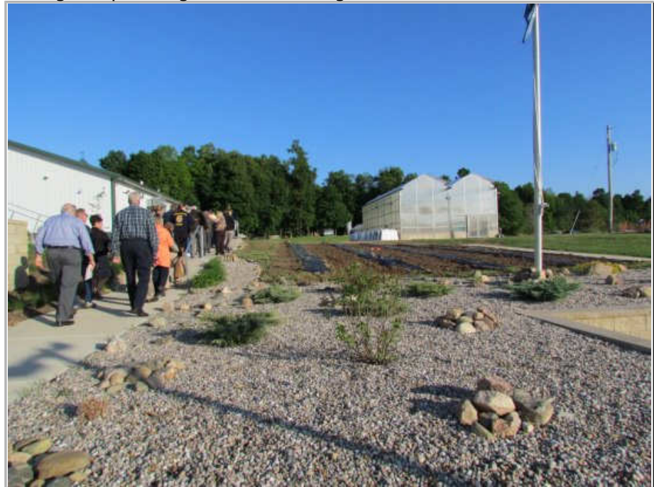
Main garden front right. Green houses far right with hodroponic plants and Quail shown below

Water that drains through the soil on the roof is directed to a 10,000 gallon under ground cistern. A pump that is on a timer pumps water from the cistern to irrigate vegetable plants and other plants on site through drip tubing intalled in the ground