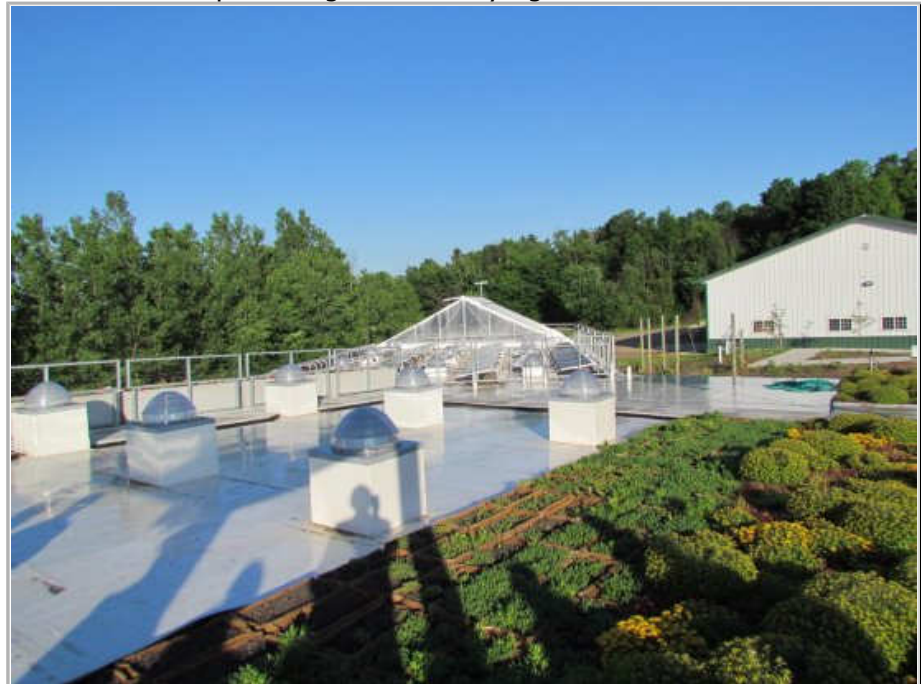
Solar panels are pictured on the roof in an area above the horticulture classroom (in front to the green house)

The white square structures with the clear domes on the roof (on the left) in the above picture are solar tube lighting collectors with frosted glass defusers below providing natural day light into the class rooms.