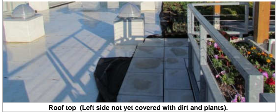
Roof top (Left side not yet covered with dirt and plants).

Lisa explained that the plants on the roof moderated the temperature extremes, keeping the roof cooler in the summer, warmer in the winter and protecting the roof membrane from the sun. The roof is designed to support the additional weight of the soil and plants.