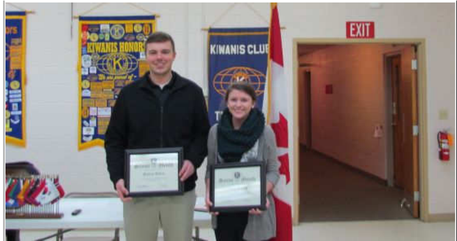
Seniors of the Month