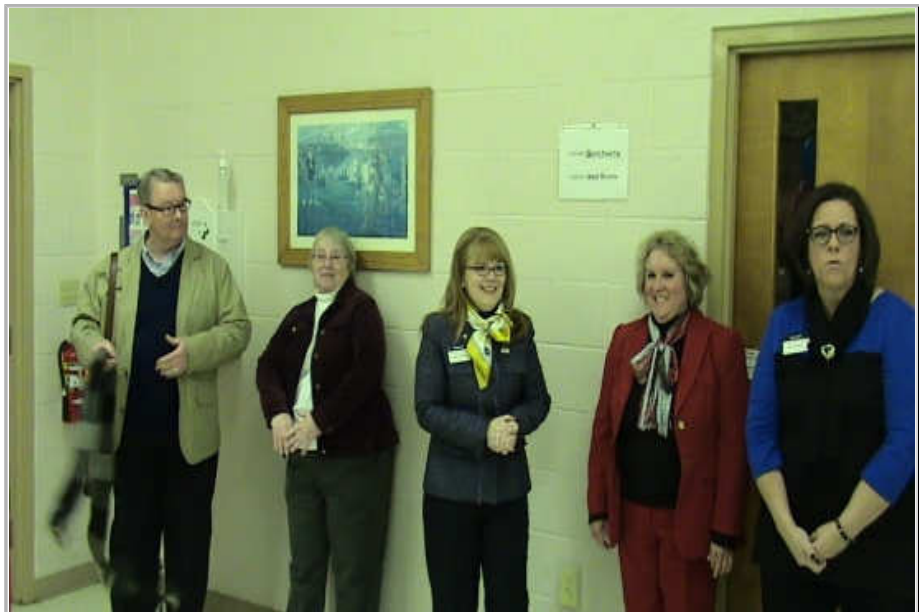
○ Center Governor Elect Bonnie Bartlett