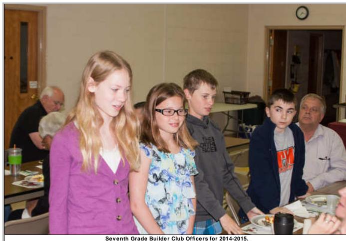
Seventh Grade Builder Club Officers for 2014-2015.